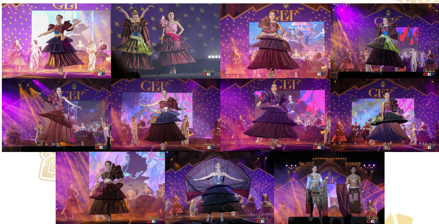
Set 3 : Creative Thai Costumes.