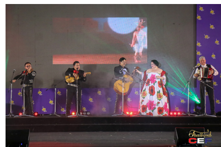
Performances from Mexico