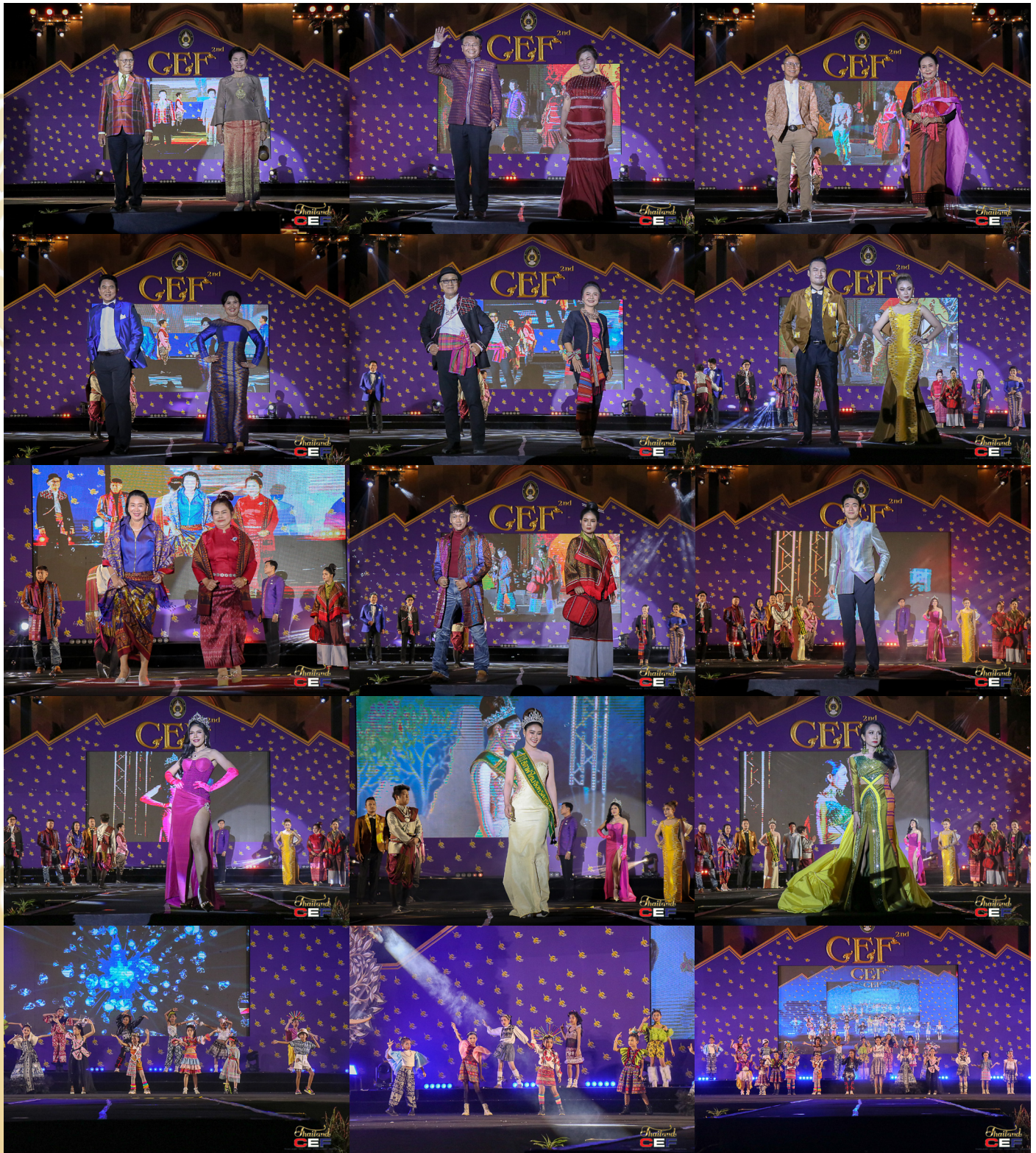
Set 1 : "Kittimasak Rak Pha Thai"

On February 12, 2024, SRRU organized an international cloth and costume show, which consisted of 3 shows, consisting of a cloth and costume show. "Kittimasak Rak Pha Thai" by heads of government agencies, barons, celebrities/singers/models Cloth display "A hundred colors and a thousand patterns International Bonds" by international artists and cloth display "Creative Thai costumes" by international models.