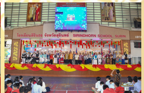
Performances outside SRRU at Sirindhorn School on February 8, 2024.