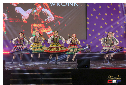
Performances from Poland