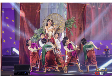
Performances from Thailand