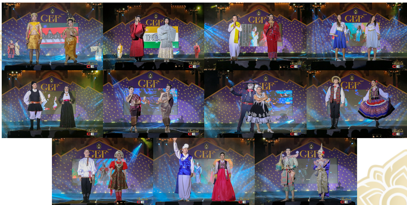
Set 2 : "A hundred colors and a thousand patterns International Bonds"