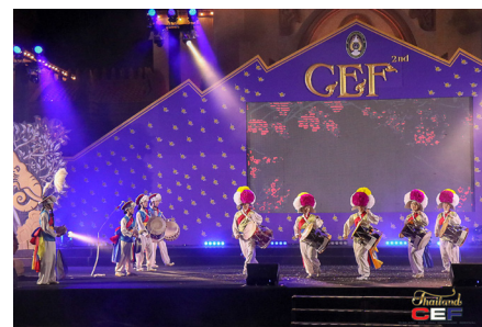
Performances from Korea Rep.