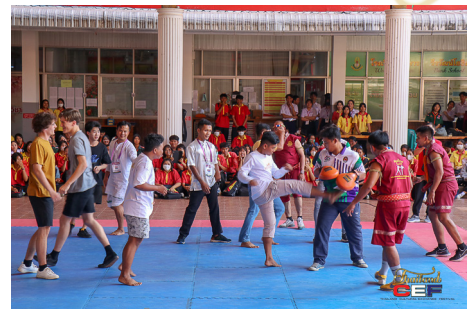
Performances outside SRRU at Weerawatyothin School on February 7, 2024.